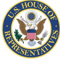
Congressman Jerrold Nadler